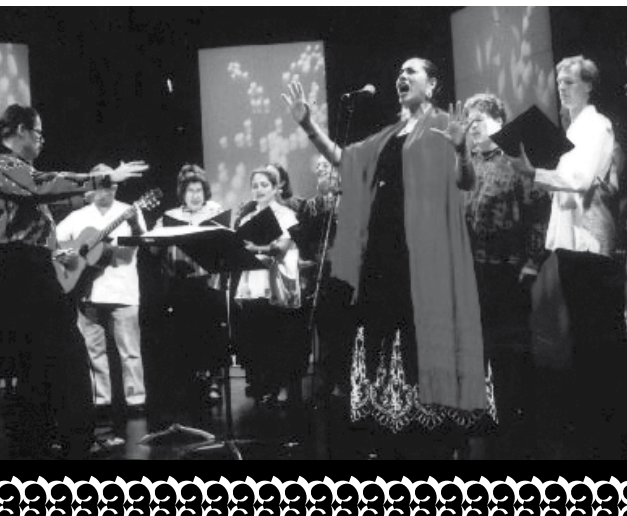
Coro Hispano de San Francisco

Dinner, including wine, with an evening of music performed by Hartnell College instrumental and choral groups to benefit the Hartnell College Music Program.