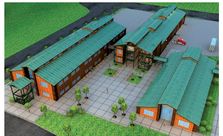
Center for Applied Technology, Alisal Campus

The final building project in Phase II is the Center for Applied Technology (CAT) on the Alisal Campus, which