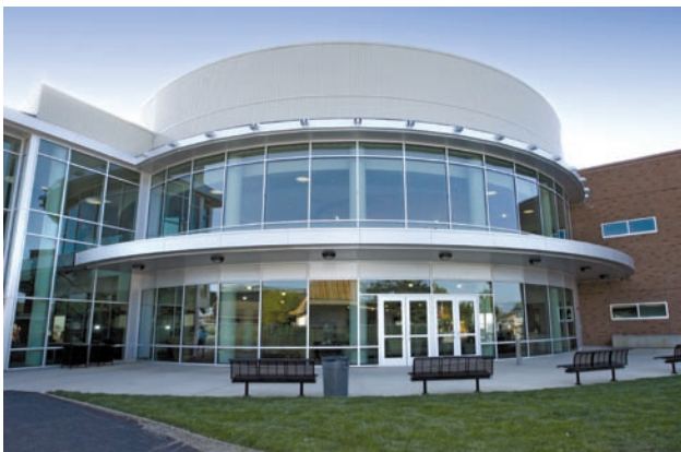
Library & Learning Resource Center and Parking Structure

Phase I of the Measure H Bond Program was a resounding success. The construction in this Phase included the 68,000-square-foot state-of-the-art Library & Learning Resource Center and the three-level parking structure, which anchor a new entrance to the college at 411 Central Avenue. With those beautiful projects completed and a rollover balance of $1 million, the District was poised to move forward to Phase II of the program.