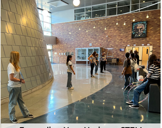
Expanding Your Horizons STEM Conference