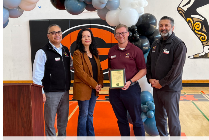
Expanding Your Horizons STEM Conference

Gonzales Unified School District Career Day