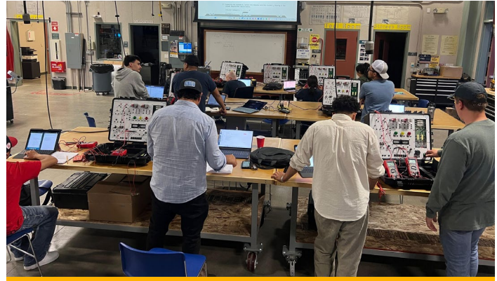
MFGT-112A students learning about Alternating Current, measuring capacitance, inductance, and their reactivity to circuits.