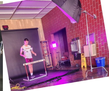
Behind the scenes at Track and Field's media day