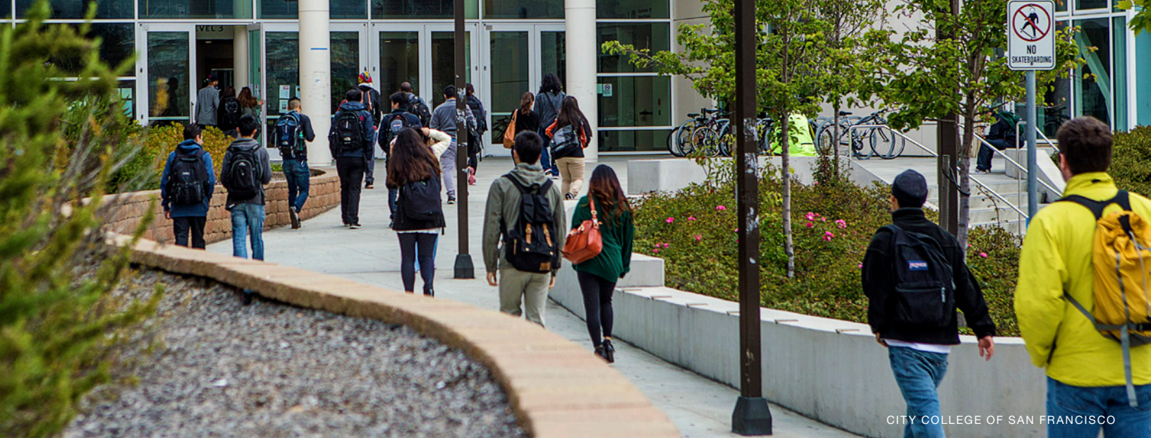
CITY COLLEGE OF SAN FRANCISCO