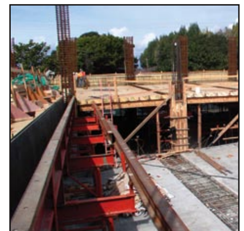
Construction and improvements throughout the campus will bring Hartnell into the 21st century.

The committee's next meeting is scheduled for October 24 at 3 p.m. in the board room of the Classroom/ Administration Building (CAB). The public is invited to attend. For more information, call the President's Office at (831) 755-6900.