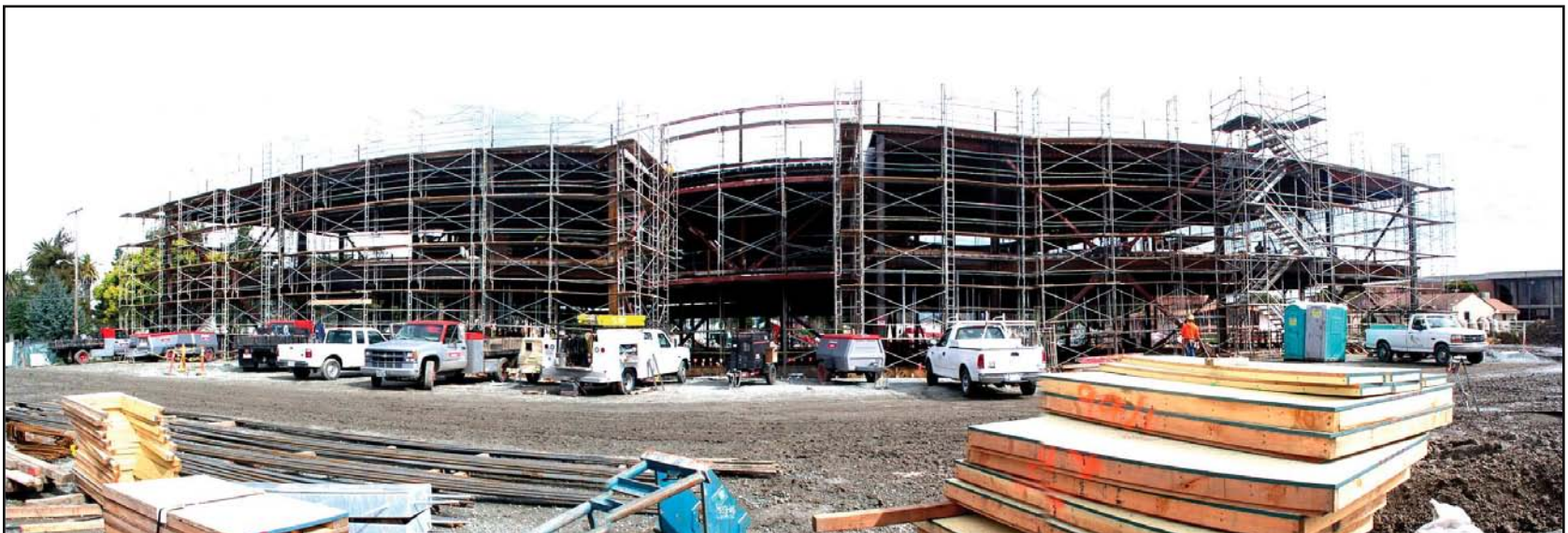
The $19 million, 68,000-square-foot Learning Resource Center (Library) is located at the corner of Homestead and Central Avenues.