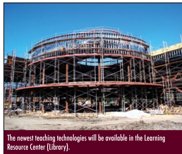
The newest teaching technologies will be available in the Learning Resource Center (Library).