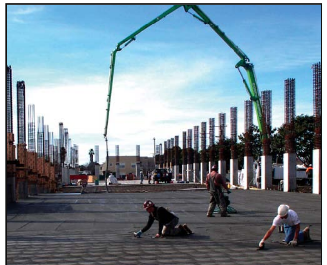
The new Parking Structure, which opens soon, will provide spaces for 1,177 vehicles.