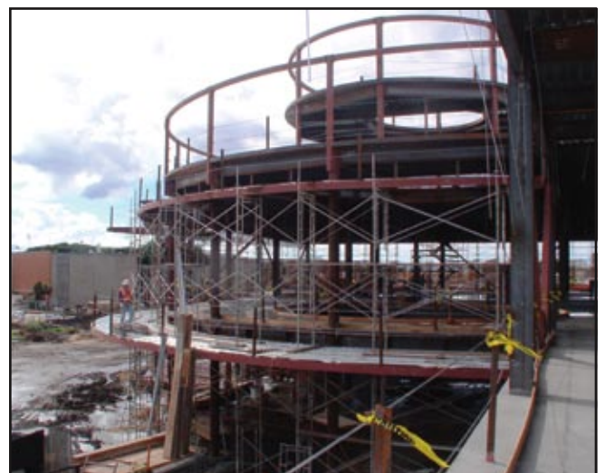
A two-story, atrium-like lobby will greet visitors at the new Learning Resource Center (Library).