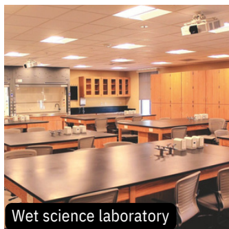
Wet science laboratory